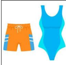
Swim Suit or Swim Trunks