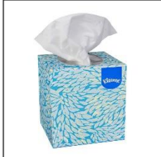
Kleenex 2 Boxes