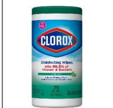
Clorox Wipes 2