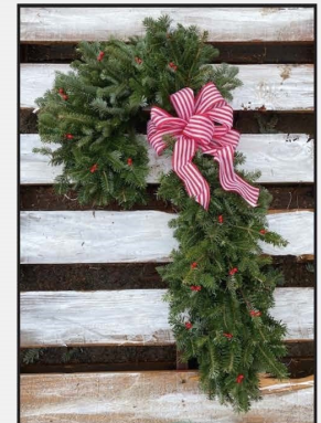
Candy Cane Wreath

Made with Fraser Fir, accented with red berries. 18" x 36" $40