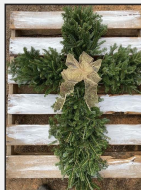
Large Fraser Fir Cross Wreath

Made with Fraser Fir, accented with a gold bow. 36" x 48" $60