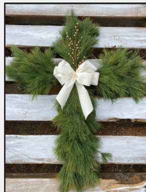
White Pine Cross

Soft White Pine, accented with a gold bow and gold berries. 30" x 36" $38