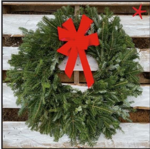
Classic Fraser Fir Wreath

Made with Fraser Fir. Fragrance lasts all season. 26" (Door Size) $30 ★ 36" $45 42" $60