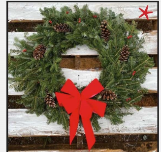
Premium Fraser Fir Wreath

Made with Fraser Fir. Accented with glitzy pine cones and berries. 26" (Door Size) $35 ★ 36" $50