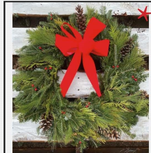
"The Natural" Wreath

Made with Fraser Fir, White Pine and Aborvitae, pine cones & berries. 22" (Door Size) $48 ★ 32" $65